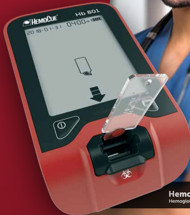
HemoCue Hb 801 Hemoglobin point-of-care testing